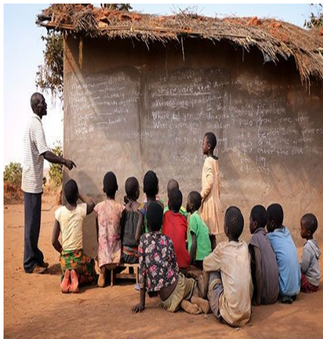
“a teacher teaching his learners behind the back of a thatched roof house”

Historically, females in African nations have been deprived of educational opportunities. This is due to such factors as traditional family practices where females are not encouraged to attend school, often dropping out due to early forced marriages and teen-