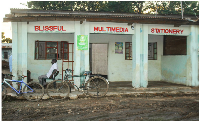
“The outside of the shop”

I n growing up and involved in certain activities, we are often unaware of their longer-term impact on our lives. Sometimes the impact is negative; sometimes it’s positive. For me it was positive. For example, I am now aware that in Africa, traditionally girls and women have been regarded as inferior, a position often reinforced by Biblical texts. However times are changing and these days, women like me are gaining new opportunities and experience.