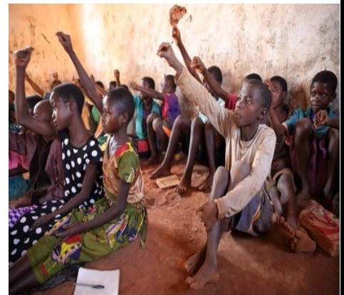
“both boys and girls are future leaders, let us give them equal opportunities of education”

It’s worth noting that at the Christine Denton Memorial School (CDMS), all students of both sexes are treated equally and encouraged to remain at school to complete all courses successfully and therefore ensure