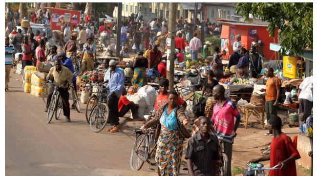
“Central part of Malawi, market sector”

T he Malawi Quarterly Newsletter aims to inform, educate and entertain all our readers. Also, our editorial team invites stories from people in the community who wish to contribute to the newsletter and improve their writing skills. Following assessment and editing by our team, there's the strong possibility of reader stories being included in future newsletters.