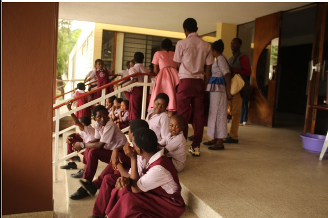
Now at MBC TV compound, teachers and learners waiting for the security guard to take them inside to see other journalists and learn how they do their work