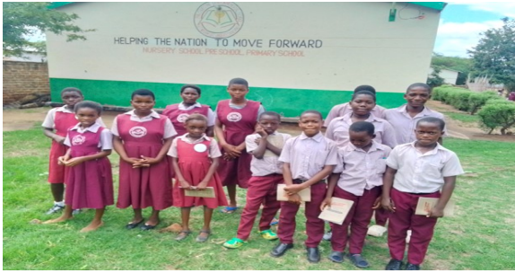
“Some of the successful learners pausing after the closing ceremony”.

the need to avoid all forms of child abuse. In summary this event proved to be a very special one, regarded as being more memorable than previous end-of-year CDMS events.”