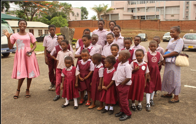
CDMS teachers and learners in Blantyre at MBC radio 1 and 2 compound